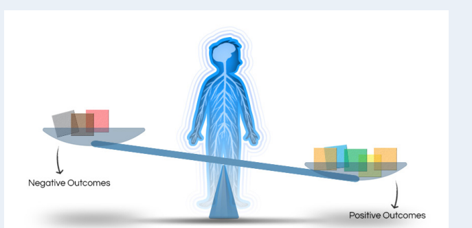
When positive experiences outweigh negative experiences, a child's "scale" tips toward positive outcomes.

One way to actively move the fulcrum to a position that makes the scale better able to bear the weight of negative experiences is to build the capabilities needed to manage stress. These include the ability to focus attention, solve problems, plan ahead, adjust to new circumstances, regulate behavior, and control impulses. These skills, many of which fall within what is called executive function and selfregulation, constitute important building blocks for dealing